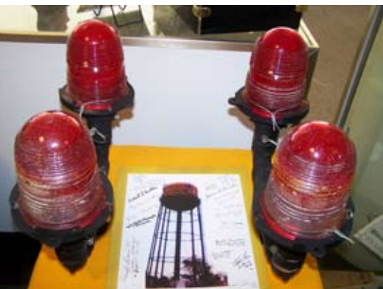
Safety lights taken from atop the historic 1947 Midwest City water tower when the structure was dismantled in 2012.

Miss MCHS robe is on display at the Midwest City High School Museum.