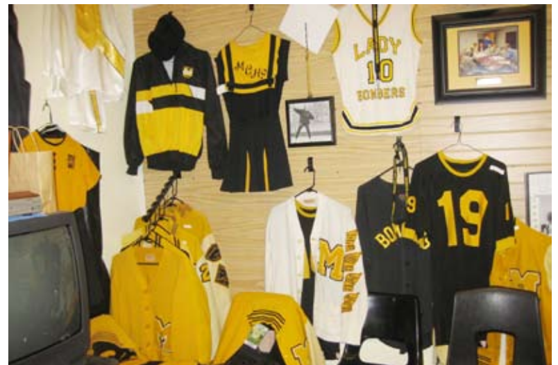
Bomber letter jackets and sweaters line a wall of MCHS Museum. In the early days of the school, they had genuine leather sleeves. Very nice! In today's MCHS, an A school academically in recent state rankings, the letter jackets go to honor roll students.